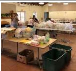
Volunteers at work in the “staging lunches for distribution” station.

The Redlands Charitable Resources Coalition (RCRC) has been providing sack lunches to our homeless neighbors every day since March 19, 2020. Now they have partnered with Family Service Association (FSA) by hosting a Community Food Station (CFS) at the FSA facility. The food station operates every day from 10:00am to 12 noon, except on Tuesdays when it operates from 1:00pm-2:00pm. Here's how it works: Community members drop off/donate sack lunches at the food station and then approximately seven volunteers share the tasks of 1) accepting donations from community members, 2) staging lunches to be distributed, 3) giving lunches to recipients, and 4) setting up/tearing down pop-up tents and tables. To date, they