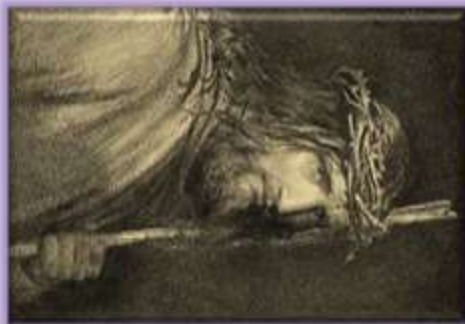
Christ the King Lutheran Church 1505 S. Ford Street Redlands, CA 92373-7128

Examine the progression on the other side of this brochure. Each Wednesday builds on the previous. Each Wednesday leads to the next and the discoveries will be cumulative, entrancing, and substantive. We will plumb the depths of repentance and come away stronger. I call you, the saints of Christ the King, to observe a holy Lent. The Lord is with us.